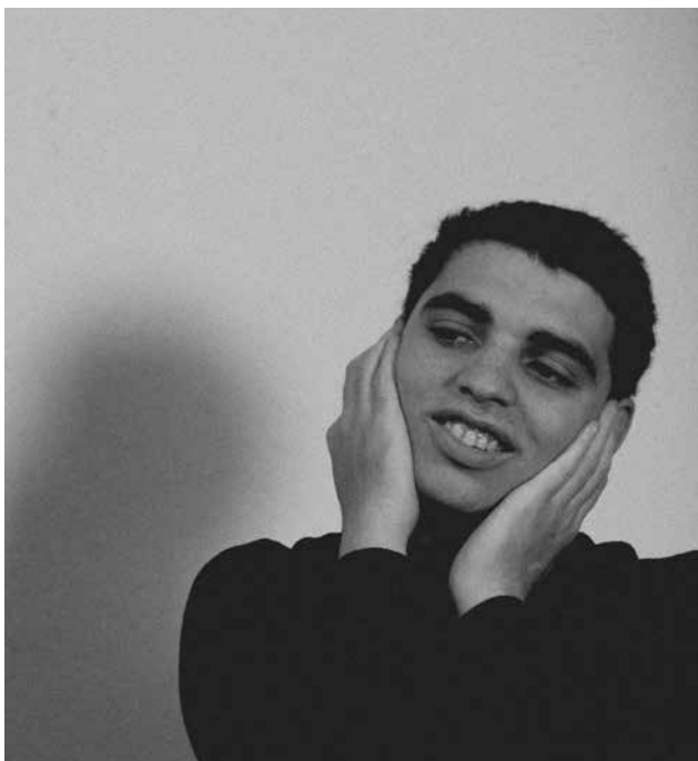
Carl Sexton Untitled , 2016

These are then meticulously cut, edited and collaged to create large complex drawings on canvas.