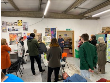
Irregular Art Schools in the Pyramid studio, 2022