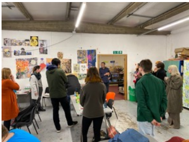
Irregular Art Schools in the Pyramid studio, 2022

www.thebluecoat.org.uk/our-community/artists/tess-gilmartin YouTube:scWXalxmH64 Instagram: @blue_room_inclusive_arts Twitter: @BlueRoomLIV