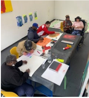
Image Credits: Image Credits: Art Riot Collective, Group of Art Riot Collective artist in the studio 2022