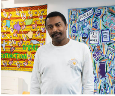
Image Credit: Thompson Hall in residence at Autograph, 2022. Photo: Zoë Maxwell