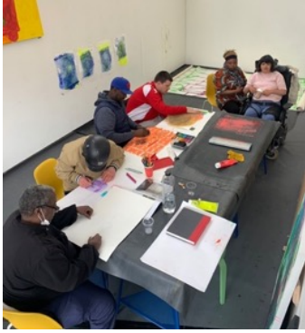
Image Credits: Image Credits: Art Riot Collective, Group of Art Riot Collective artist in the studio 2022