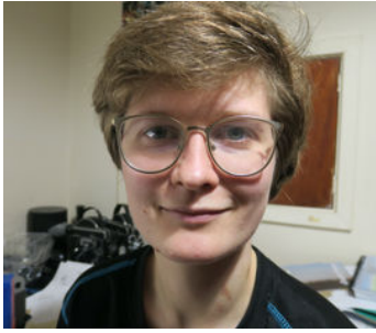
Image Credits: Alan Van Wijgerden, 'Jazz', 2022 ©Alan Van Wijgerden