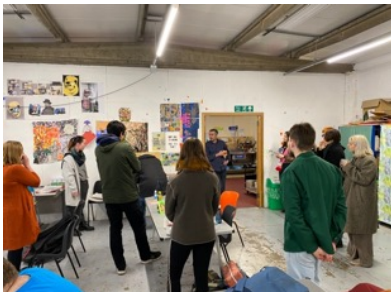
Image Credit: Irregular Art Schools in the Pyramid studio, 2022 © Irregular Art Schools

www.irregularartschools.org Facebook: Pyramid.of.Arts Instagram: @pyramid_arts Twitter: @pyramid_of_arts