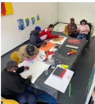
Image Credits: Image Credits: Art Riot Collective, Group of Art Riot Collective artist in the studio 2022