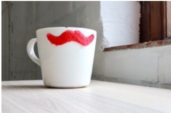
Image Credits: Sonia Boué, The Artist is Not Present, 2022 © Sonia Boué