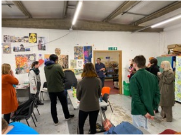
Image Credit: Irregular Art Schools in the Pyramid studio, 2022 © Irregular Art Schools