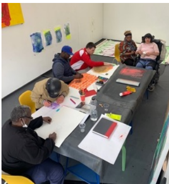
Image Credits: Image Credits: Art Riot Collective, Group of Art Riot Collective artist in the studio 2022